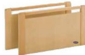
Susanne bed end